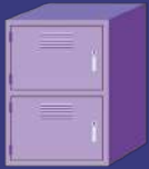
Postage & Collection Services