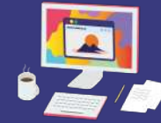
Member's Community Portal