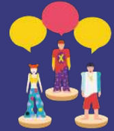
Venue credits: 50% of your paid membership