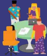
Access to Meeting Room