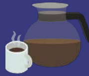
Complimentary Access to Social Pantry